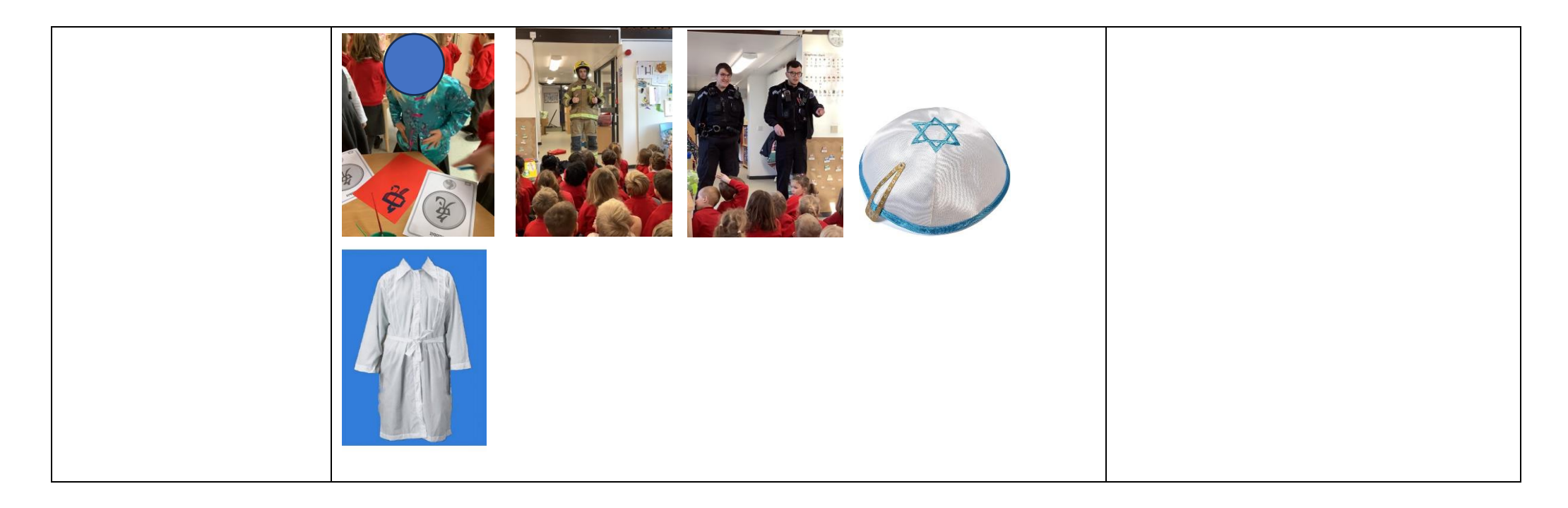
Red = new learning to be planned and taught